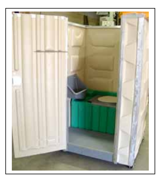
Cut Off Model GJ 350CO