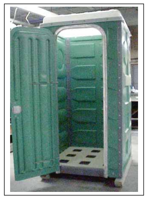
Flat Floor Model GJFF 350